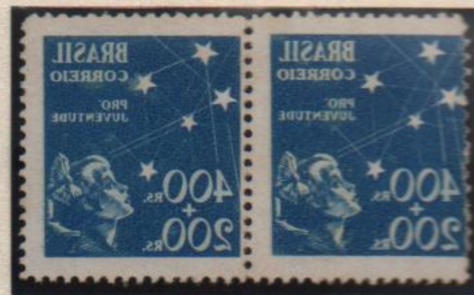
All proofs reverse-printed, no watermarks.