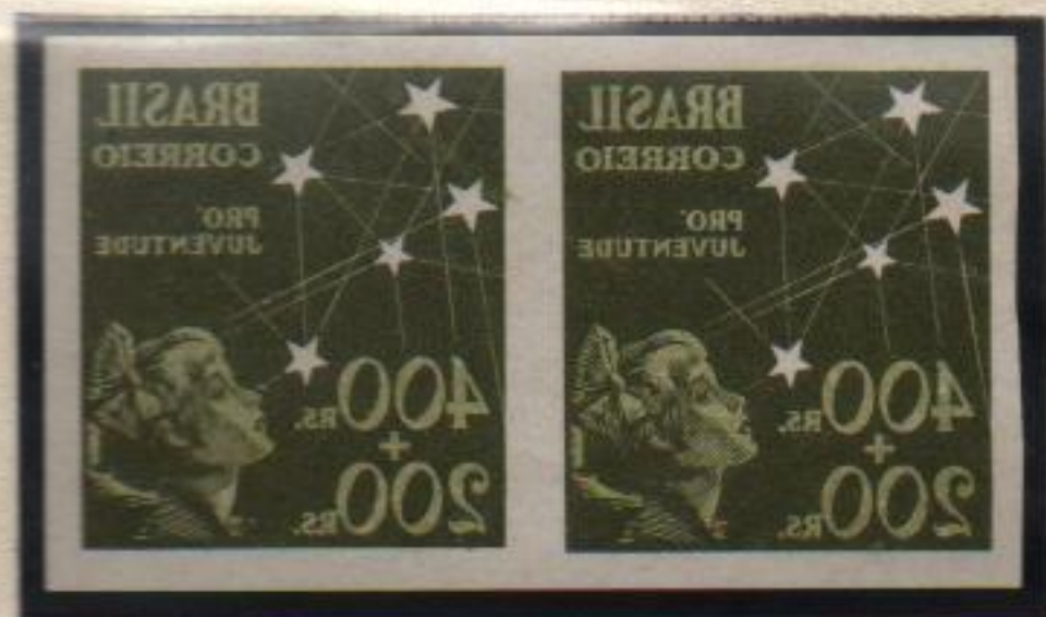
Definitive color proofs, in olive-green, imperforate. Others in light-blue and dark-blue, perforate and imperforate.