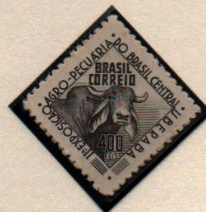
Standard stamp and proofs on card paper, no watermarks, violet and blue.