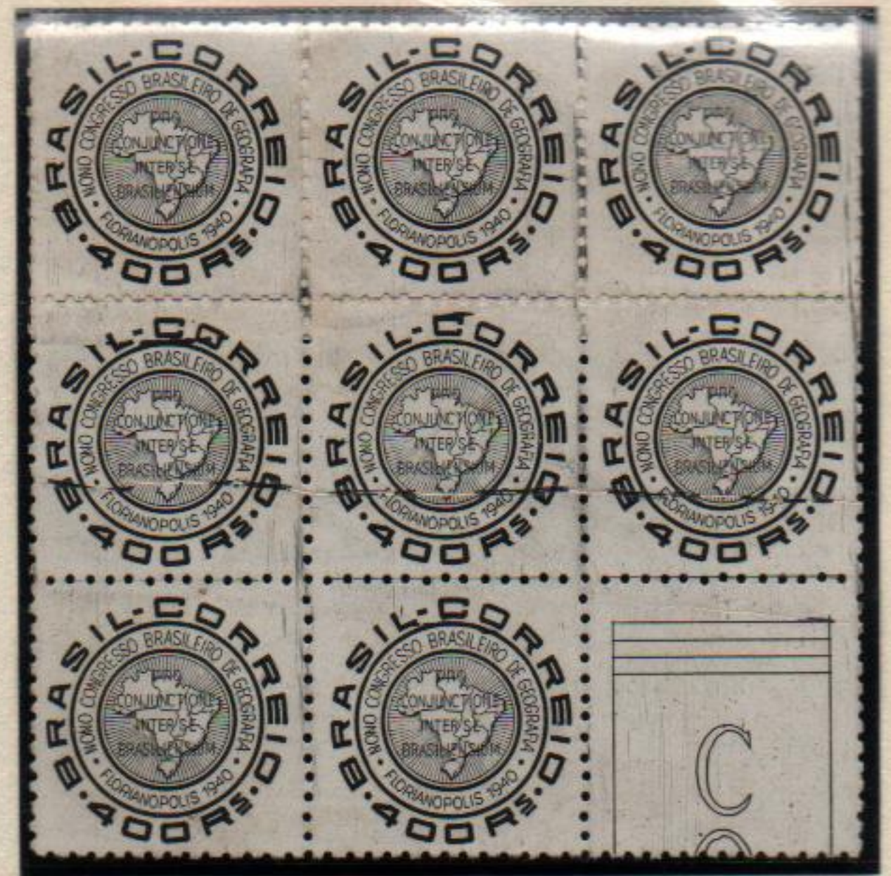
Black proofs, couché paper, no watermarks.