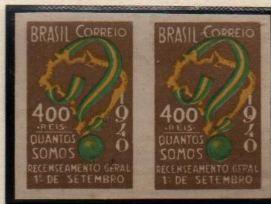
Definitive color essay proofs, no perforations or watermarks.