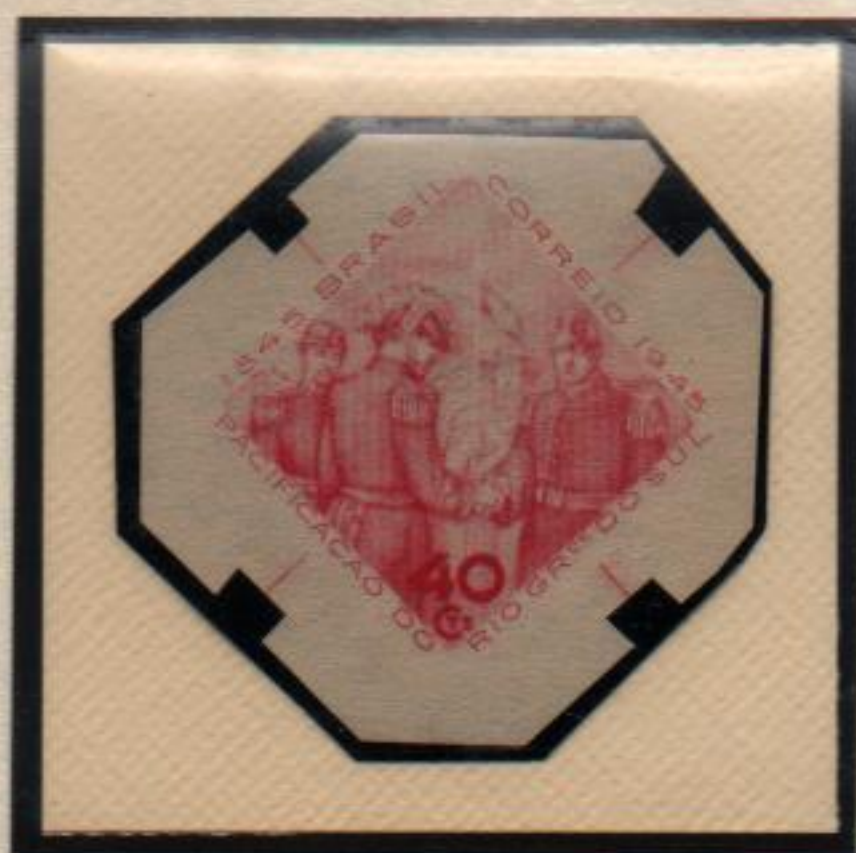
Luxe proof, red, with vertical "T – FEIXES DE LINHAS" (Line Bundles) watermark.