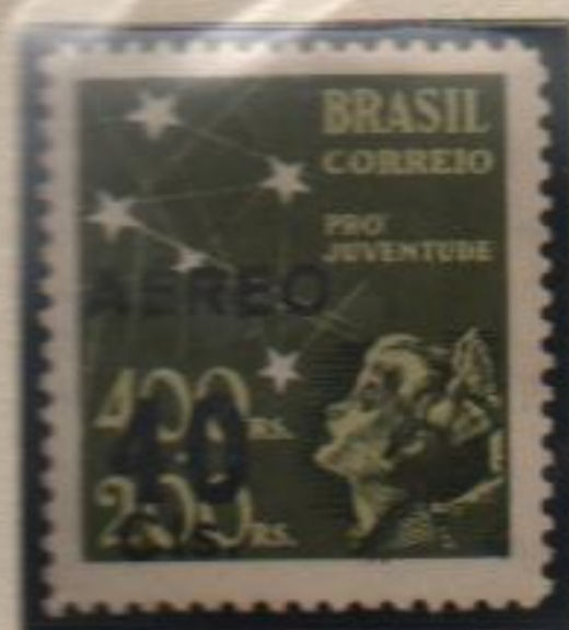
Standard stamp, olive-green, with black Cr$ 0,40 overprint, "Girl and Southern Cross".