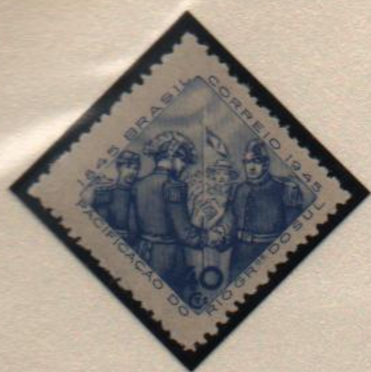
Standard stamp with "O – CASA+" (House) watermark.

Stamp featuring Duque de Caxias and Davi José Martins Canabarro, one of the leaders of the Farroupilha Revolution who accepted the amnesty agreement conceded by the government.