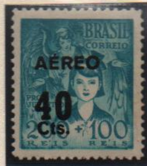
Light-blue proof with overprint, "Child and Guardian Angel".