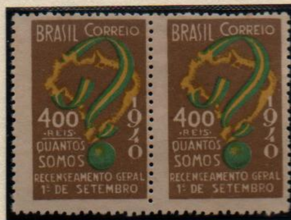
Finalized essay, no watermarks.