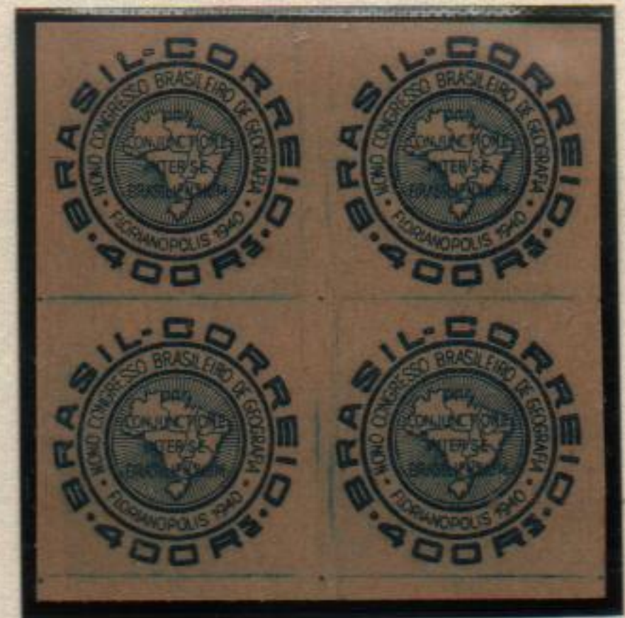
Blue proofs, newsprint, no perforations or watermarks.