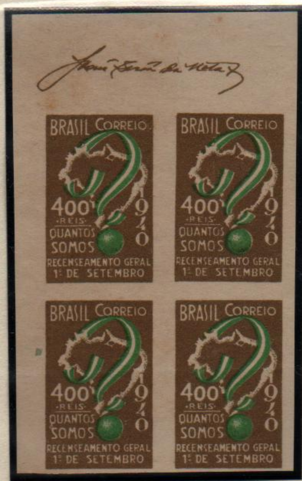
Partial essay proofs, without yellow, no perforations or watermarks.