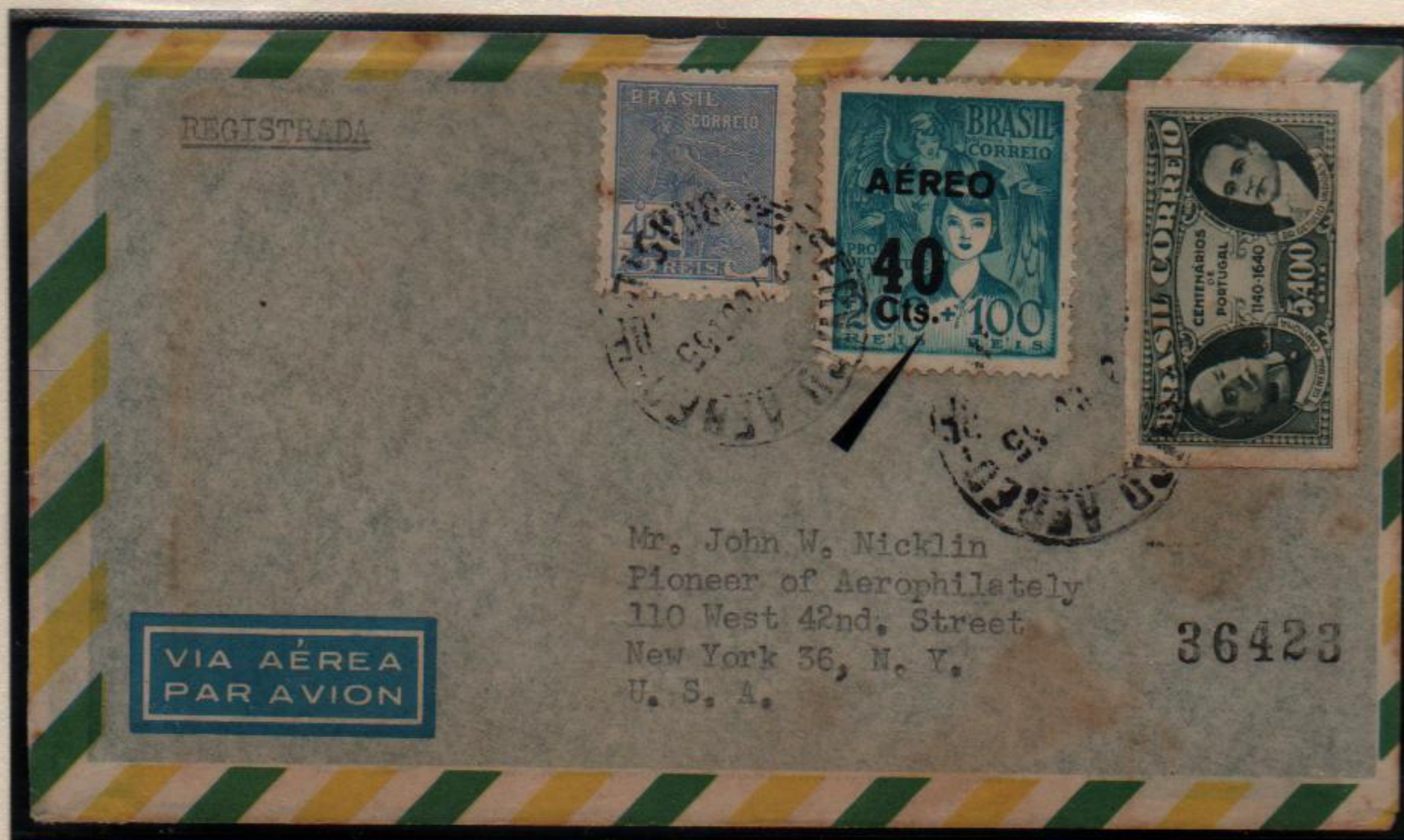
Circulated cover, BR/USA, registered mail, stamped with a light-blue air-mail proof, "Child and Guardian Angel", with Cr$ 0,40 overprint, among others, instead of the olive-green "Girl and Southern Cross" stamp.