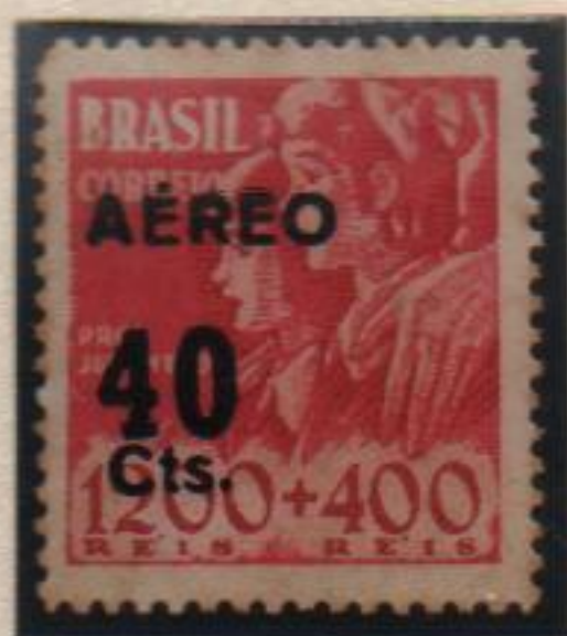
Red proof with overprint, "Helping Children".