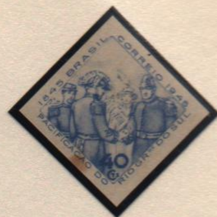
Proof, fine paper, no perforations or watermarks.