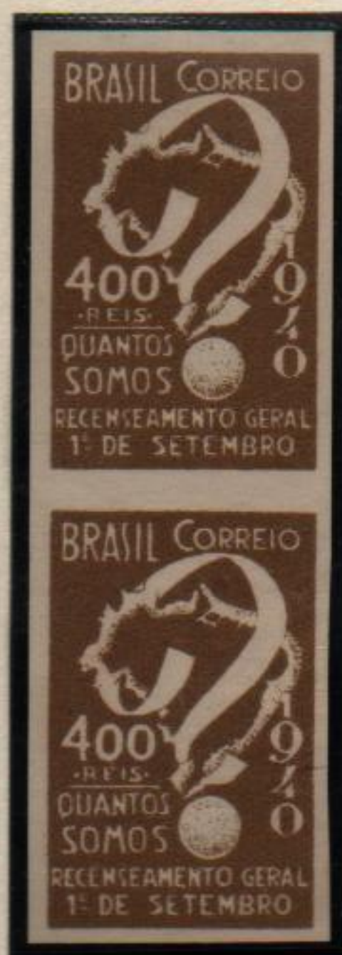
Partial essay proofs, brown only.