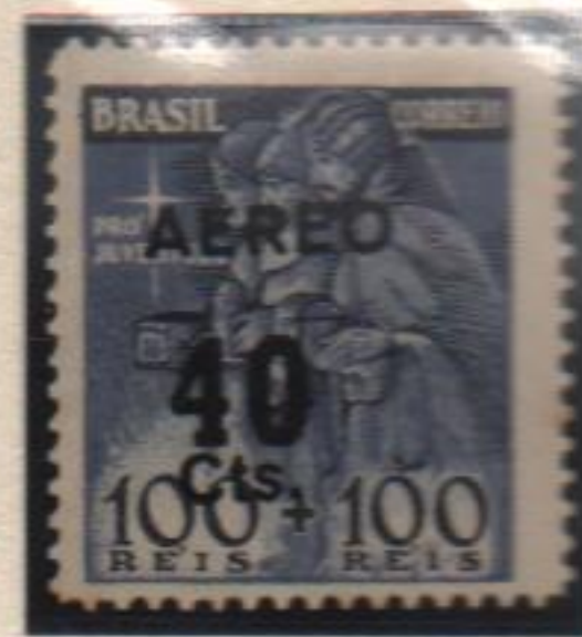
Marine-blue proof with overprint, "Three Kings".