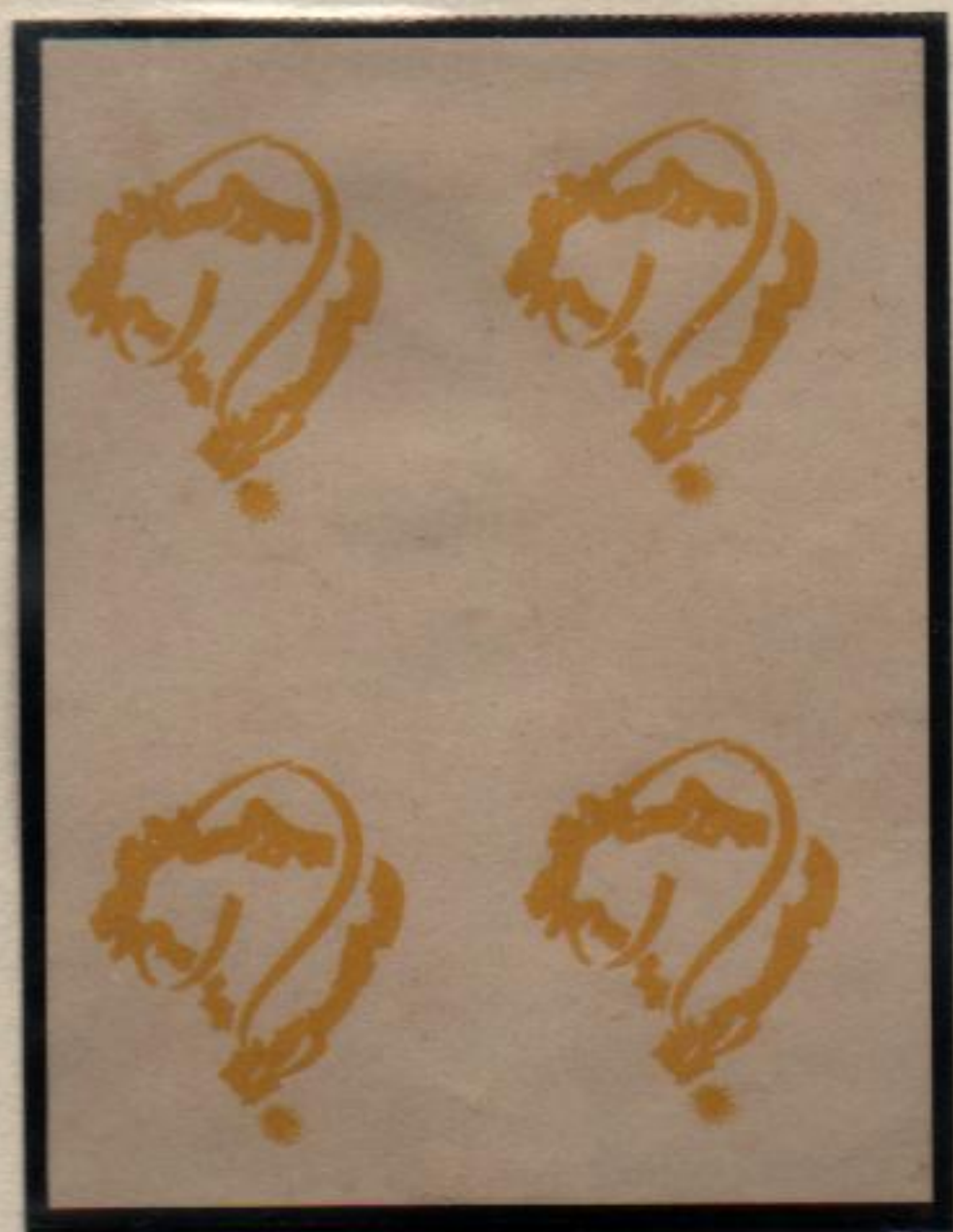
Initial essay proofs, yellow only, no perforations or watermarks.