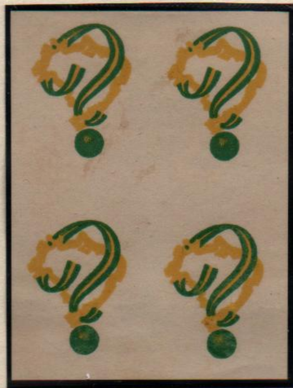
Partial essay proofs, yellow and green, no perforations or watermark.