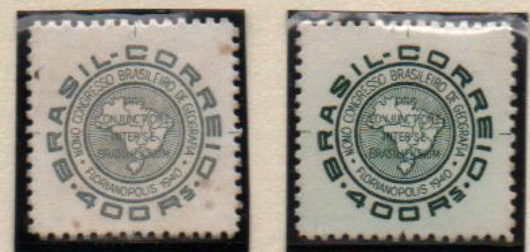
Luxe proofs, card paper, no watermarks, red, brown, gray and green.