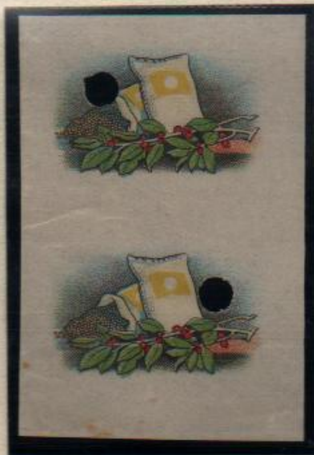
Addition of red and black, no perforations, with security punches.