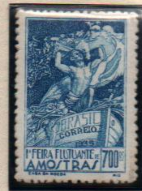
Light-blue essay on card paper.