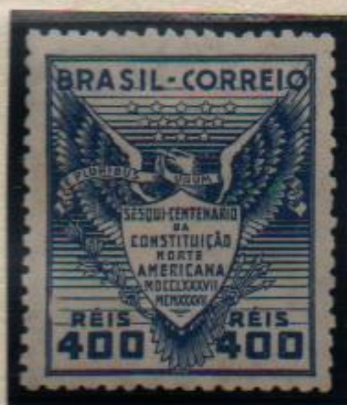
Standard stamp, "N - Correinho" watermark.