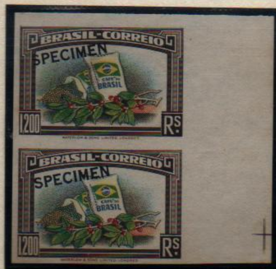
Addition of the frame, no perforations, with overprint "specimen".