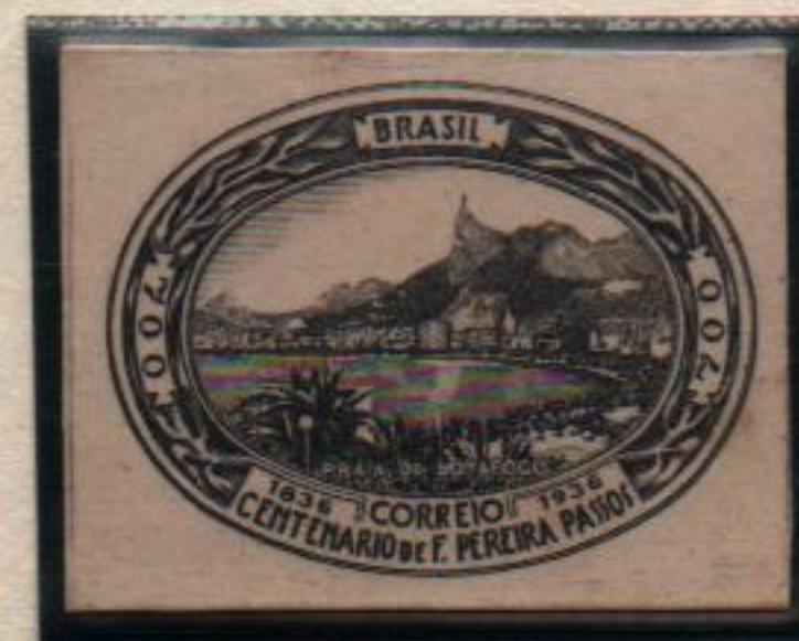
Black proof, card paper.