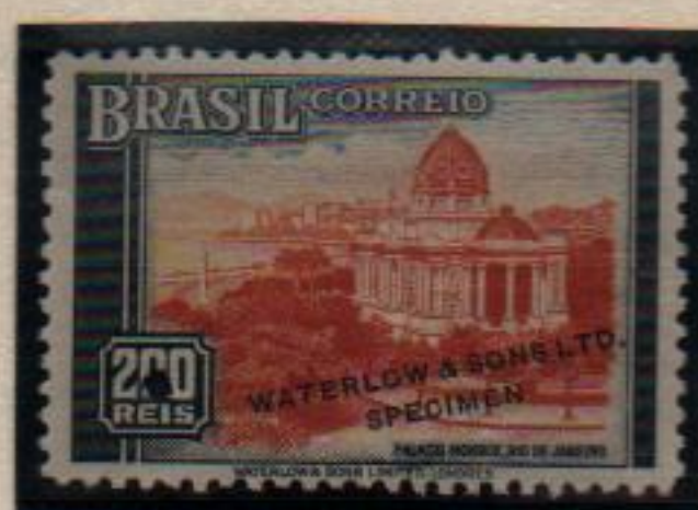
Green-frame proof with red central vignette instead of ochre and blue, respectively security punch and overprint "Waterlow & Sons Ltd. – Specimen".