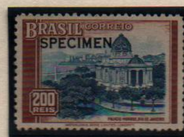
Definitive proof with overprint "specimen".