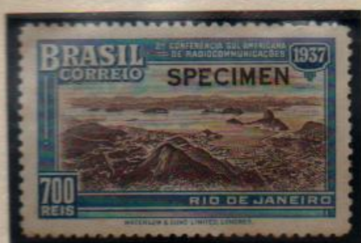
Definitive proof with overprint "Specimen".