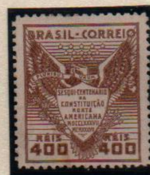
Proofs on thick paper, no watermark, in red, violet and chestnut brown.