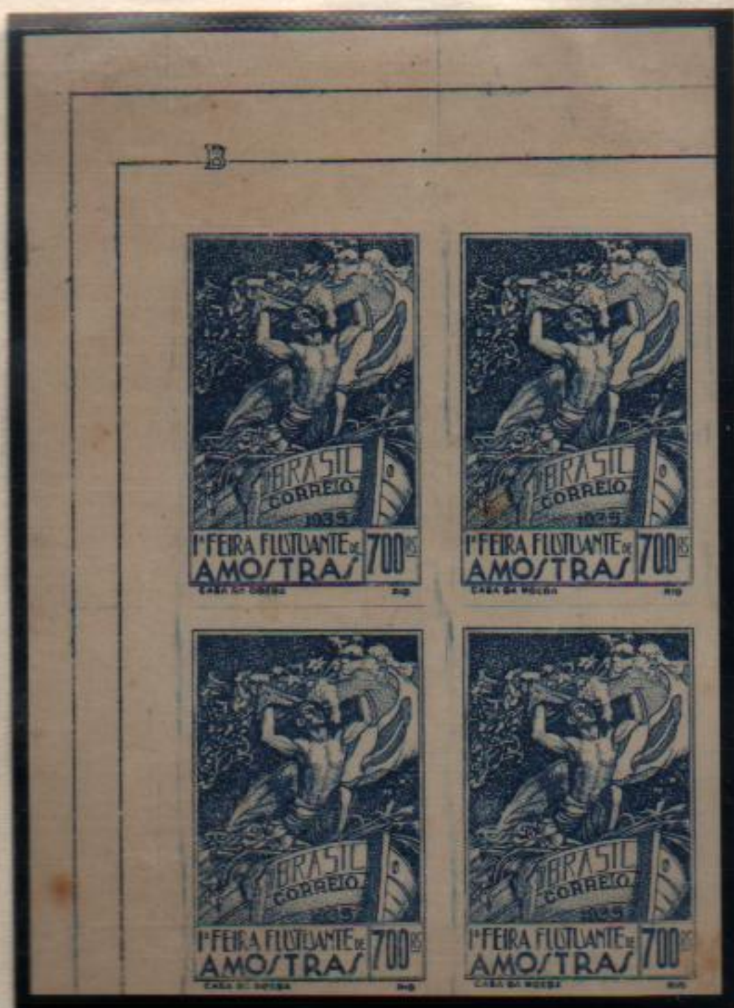
Dark blue essays, no perforations or watermarks, gummed.