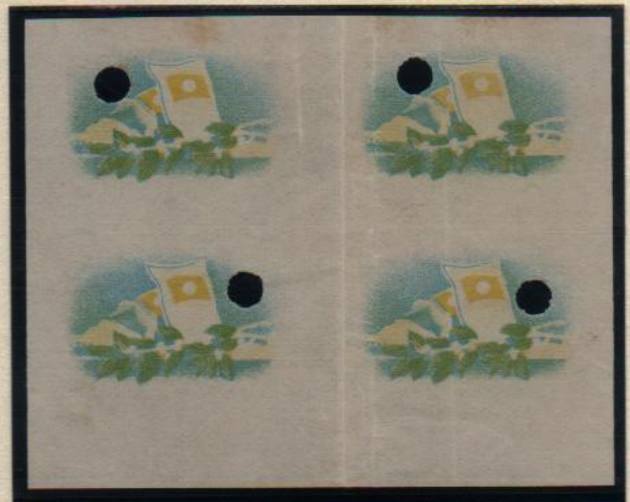
Addition of blue and green, no perforations, with security punches.