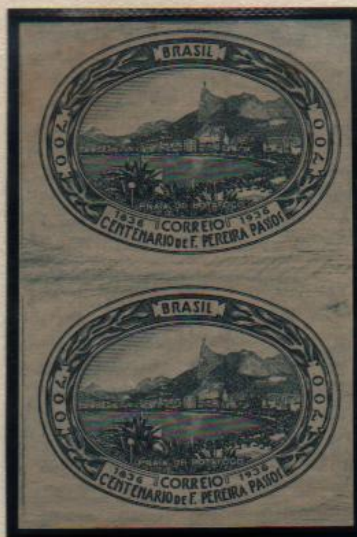
Marine blue proof, fine paper, imperforate, "N - Correinho" watermark instead of "L" Coat of Arms.