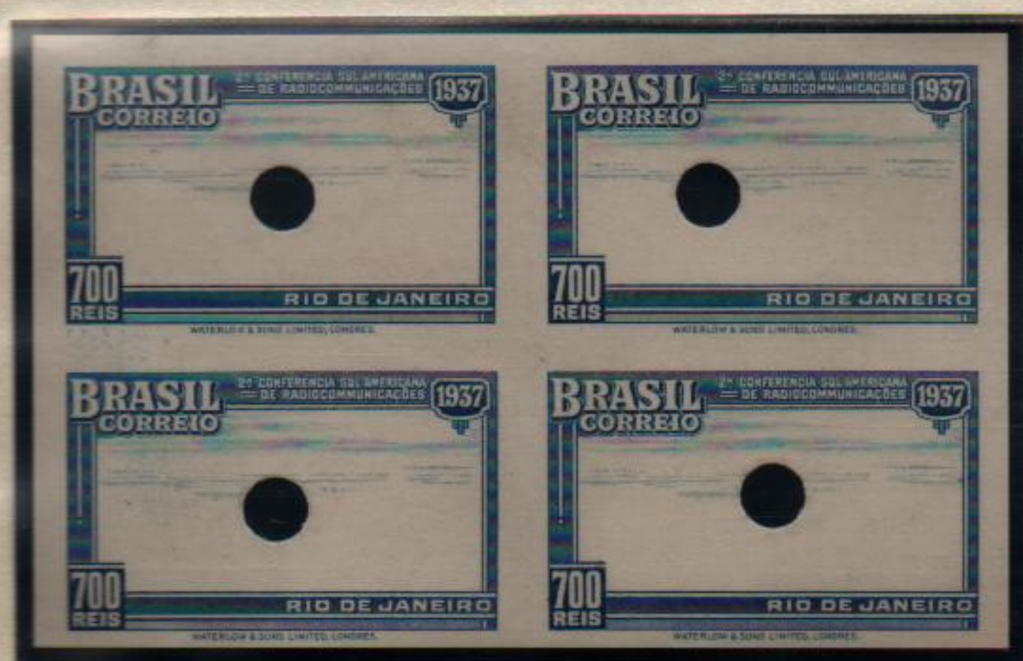
Partial proofs of frame only, no perforations, with security punches.