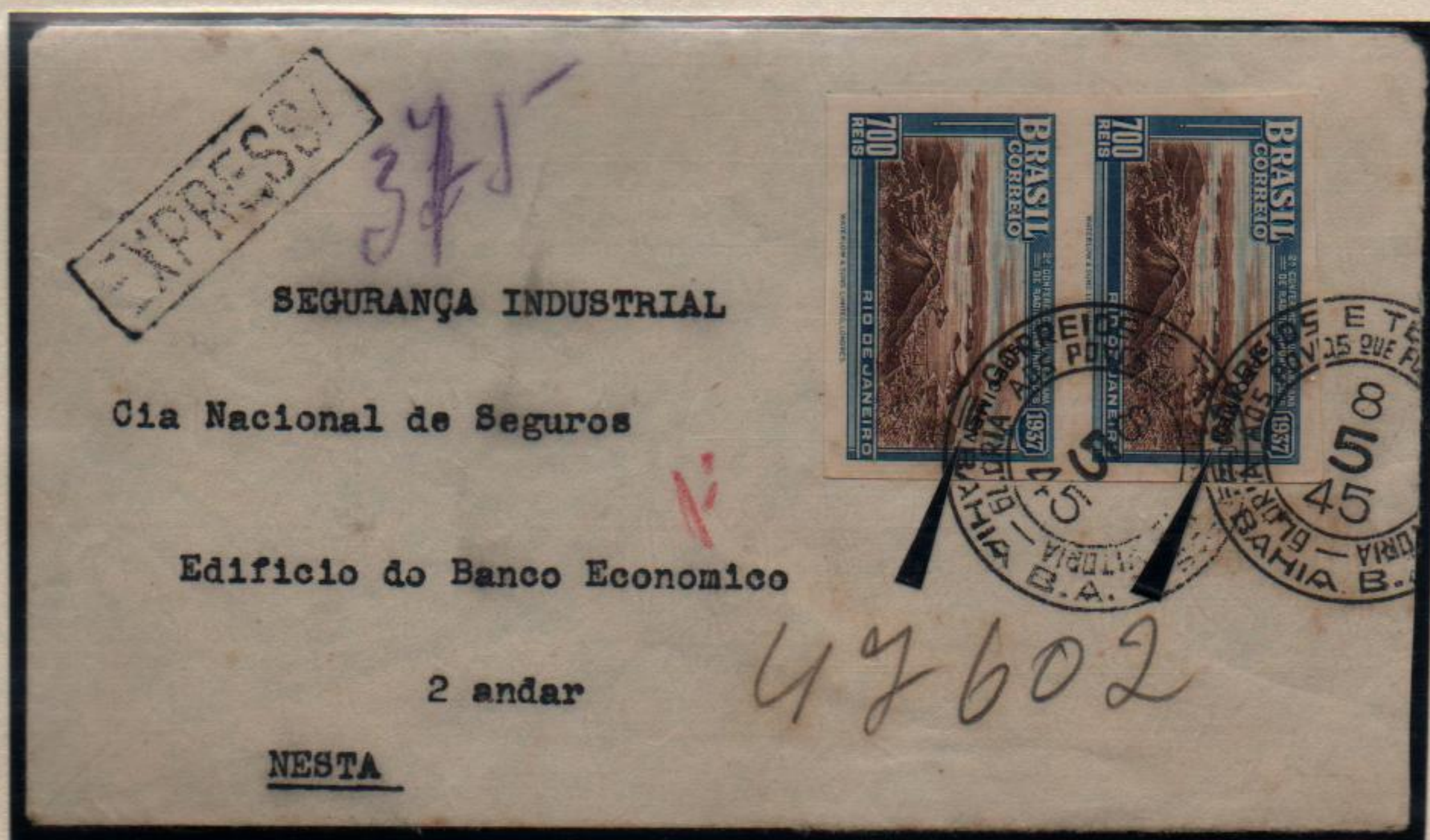
Circulate Express cover in Bahia/BR, with backstamp on reverse, carrying a pair of 700 réis stamps, above, imperforate specimens with light brown instead of dark brown central vignette.