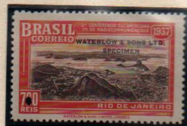
Proof, orange frame, overprint "Waterlow & Sons Ltd. Specimen", and security punch.