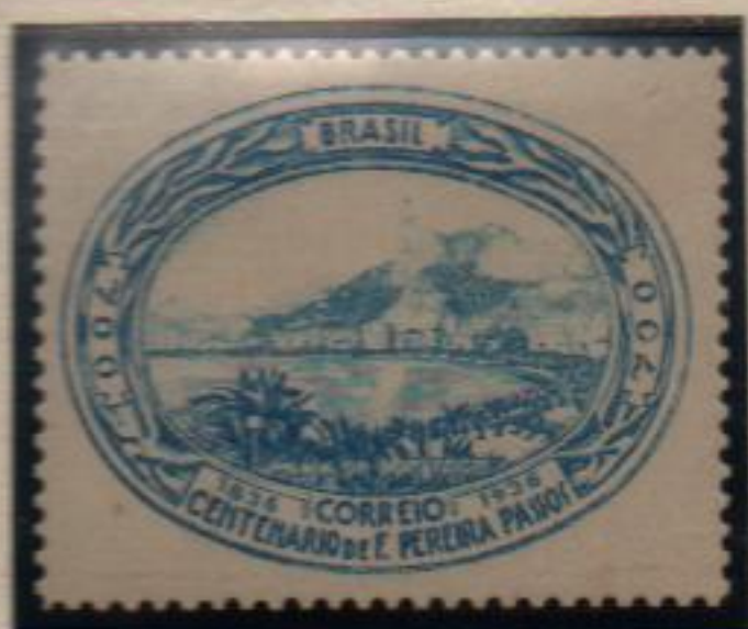
Standard stamp, blue, "L" Coat of Arms watermark.

MAYOR OF RIO DE JANEIRO FROM 1903 TO 1906.