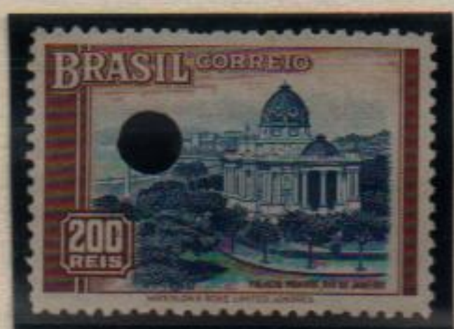
Definitive proof with security punch.