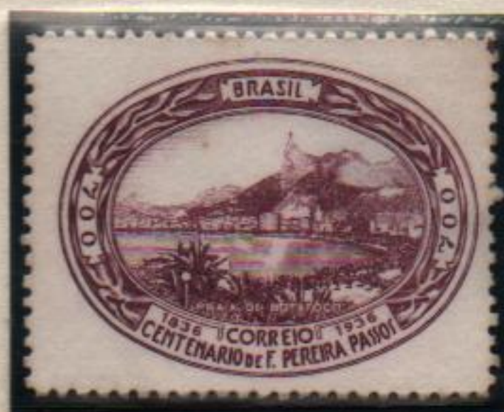
Wine color proof, card paper, perforate.