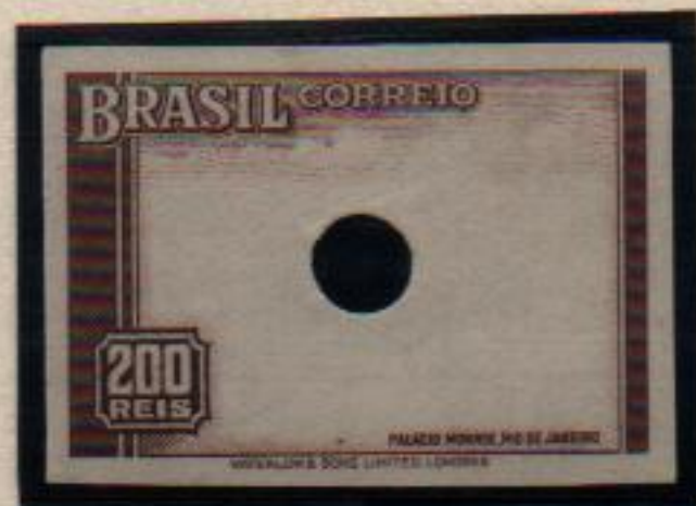
Frame-only proof, but in brown instead of ochre, with security punch, imperforate.