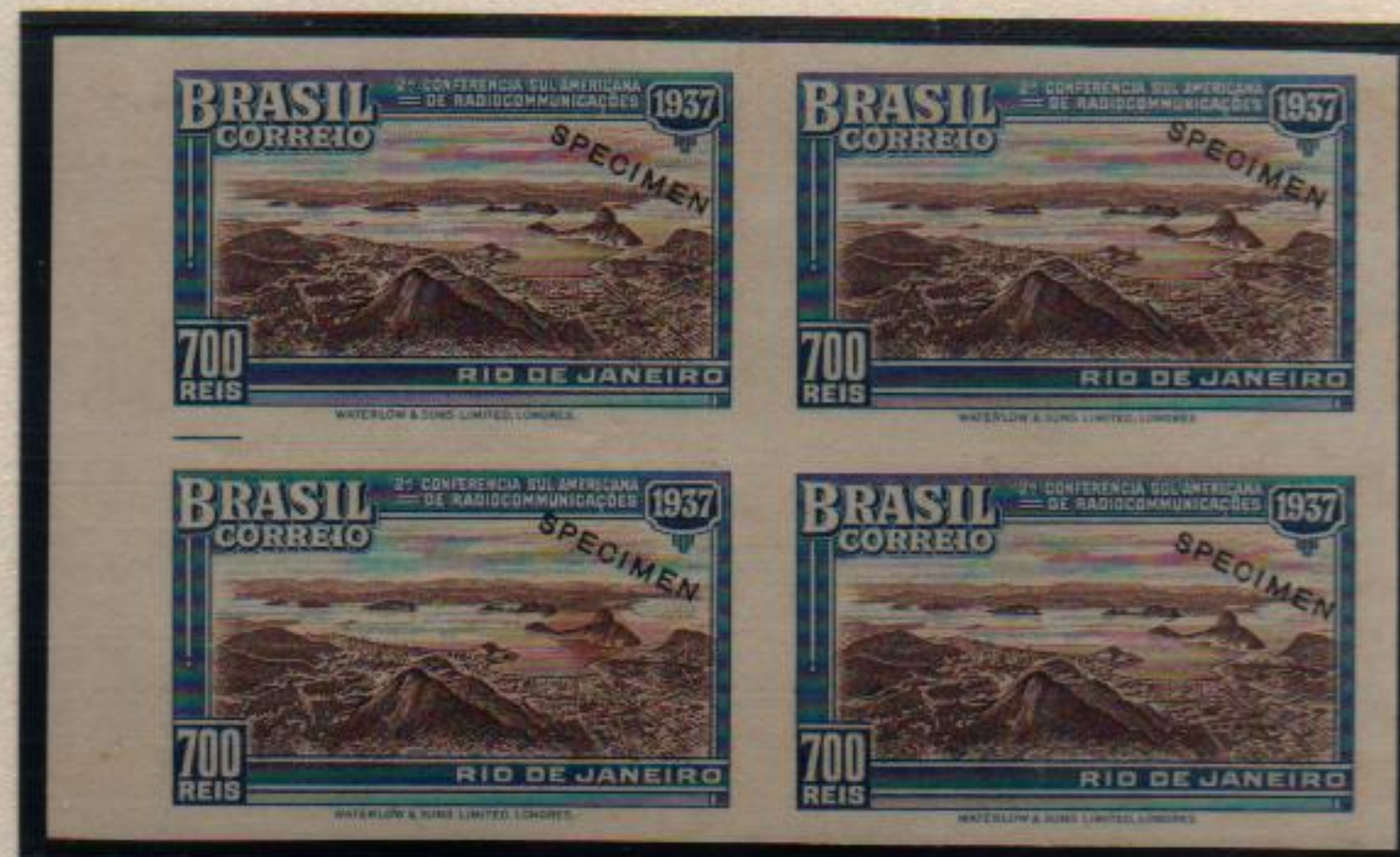
Imperforate proofs with overprint "Specimen". Central vignettes in light brown.