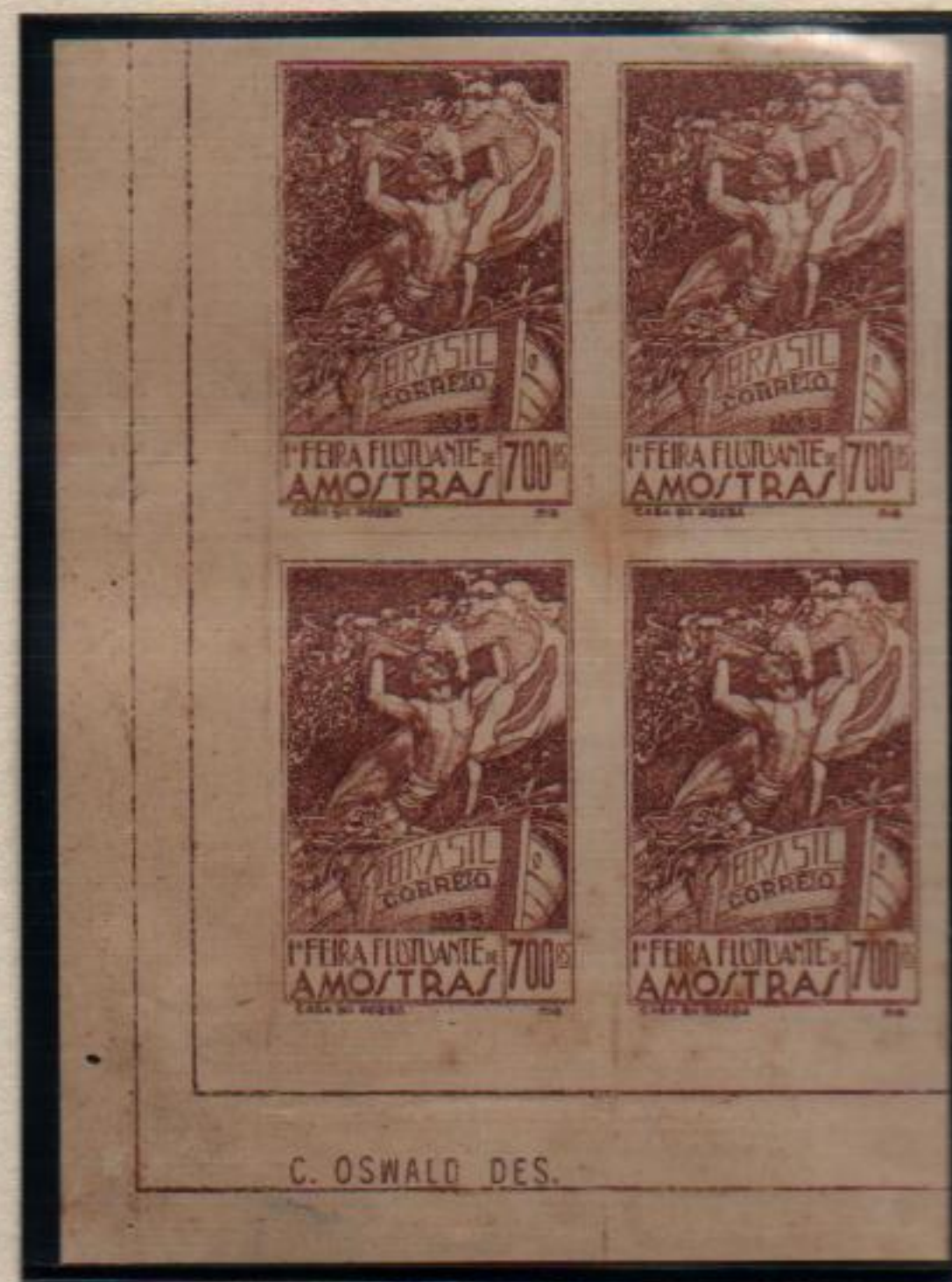
Brown essays, no perforations or watermarks, gummed.