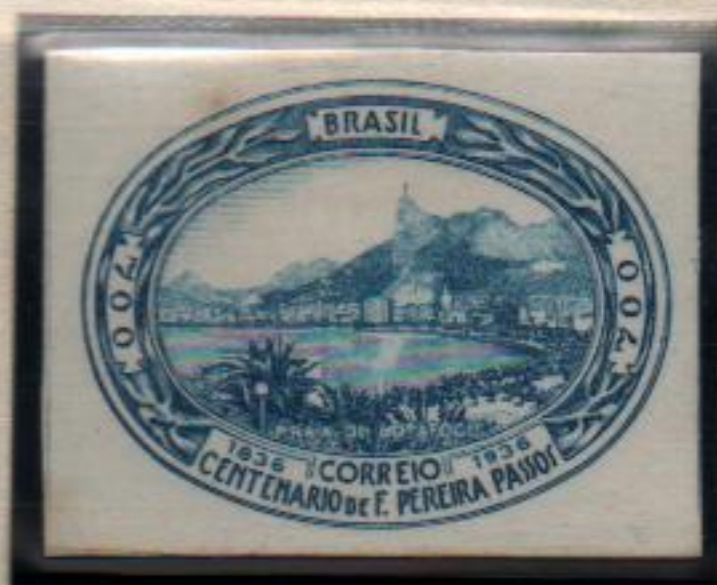
Blue proof, card paper.