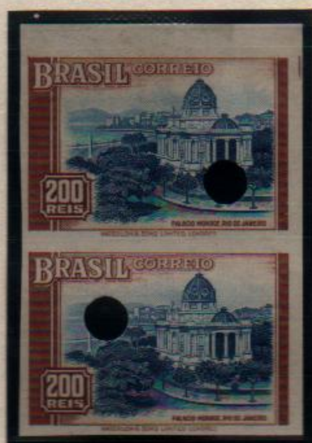
Imperforate proofs with security punches.