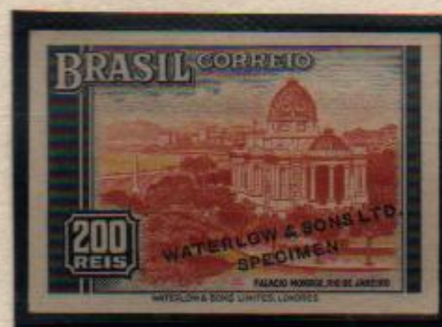
Green-frame proof with red central vignette instead of ochre and blue, respectively; overprint "Waterlow & Sons Ltd. – Specimen".