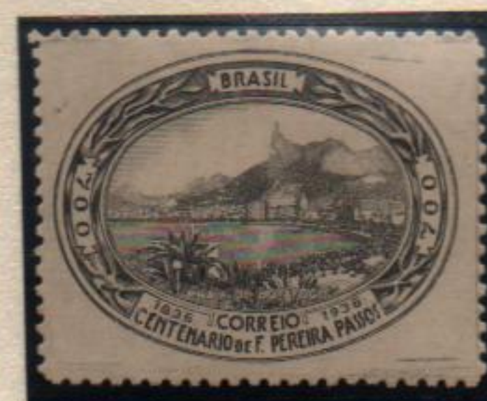
Standard stamp, black, "L" Coat of Arms watermark.