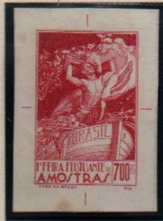
Die proof of the essay, in red, no perforations or watermarks.