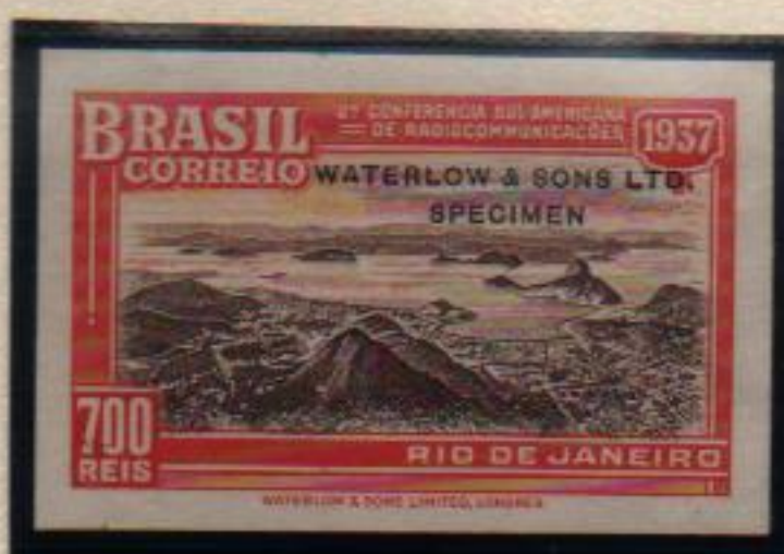
Imperforate proof, orange frame and overprint "Waterlow & Sons Ltd. Specimen".