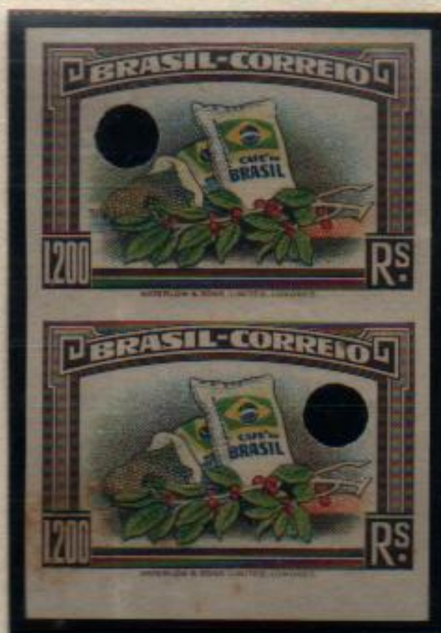
Addition of the frame, no perforations, with security punches.