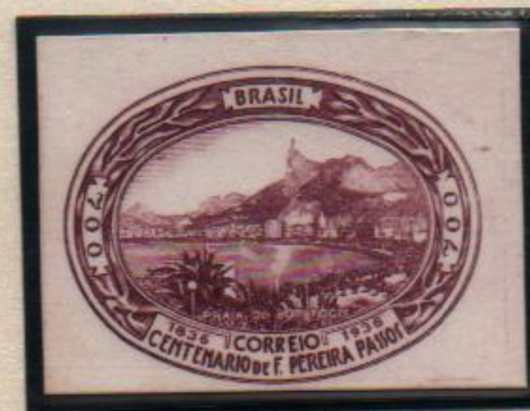
Wine color proof, card paper.