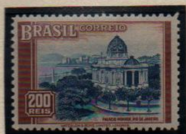
Definitive stamp, with ochre frame and blue central vignette.

200 réis stamp, figuring the Monroe Palace, Rio de Janeiro, belonging to the series "Brazilian Tourist Advertising".