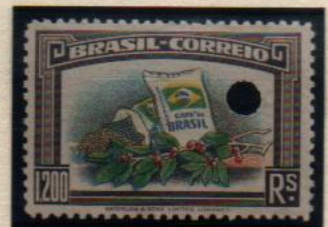
Finished stamp, with perforations and security punch.