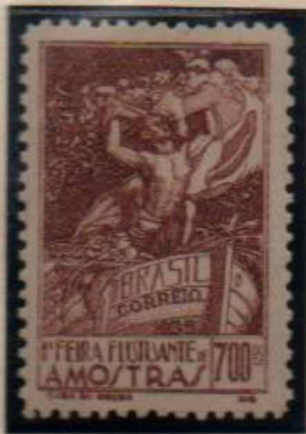
Essay in brown, gummed, no watermarks.