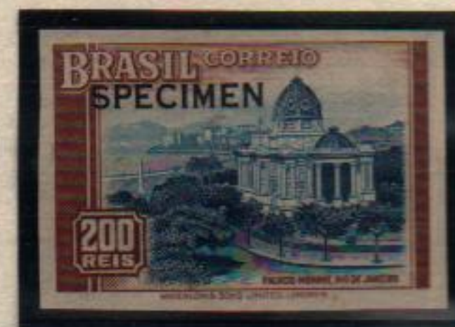
Definitive colors proof and overprint "specimen", imperforate.