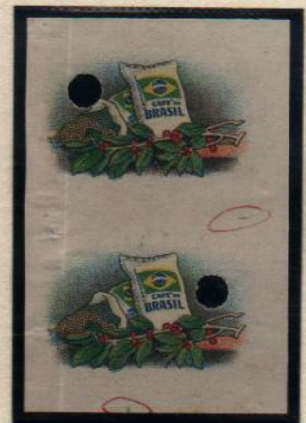
Addition of dark green, no perforations, security punches. Corrections in red.