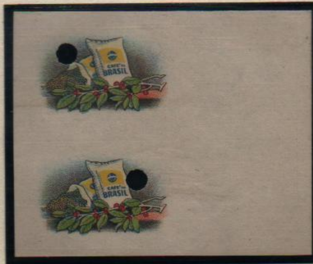
Addition of the legends and blue symbols, no perforations, with security punches.