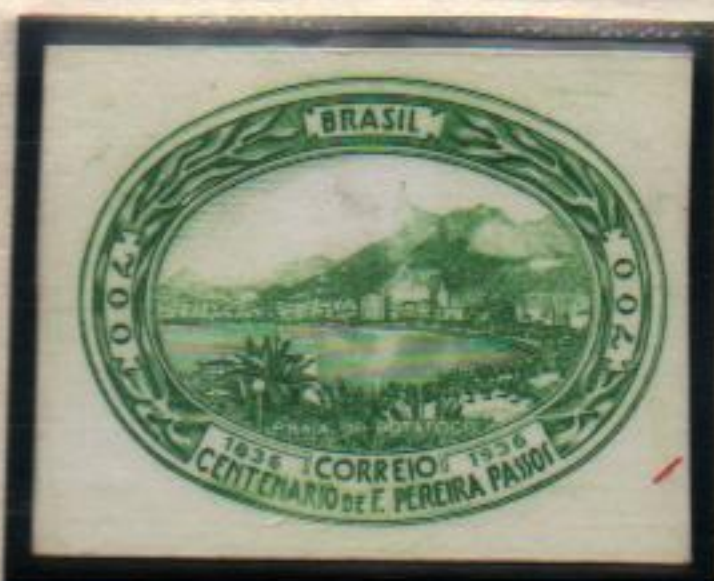
Green proof, card paper.